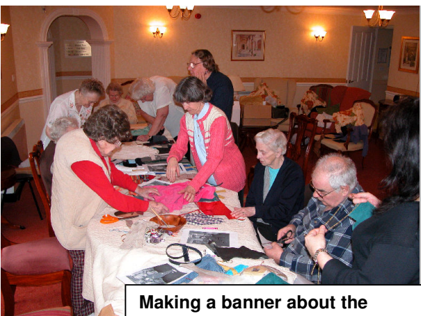
closure of post offices at Fairfax Court sheltered housing as part of the work of the Arts Action Team

In relation to arts the Arts Action Team continue to deliver opportunities for people of all ages with increasing numbers involved in the activities, making a real difference to the communities and groups they work with. They have also raised significant levels of additional funding often with the Arts Council and this year also saw £50K from the Wellcome Trust for Young peoples film making activities. They continue to act as the European partner for the Youth 4 Media network with four of our young people just recently returned from a media camp in Poland and one planned in York for 2007/08.