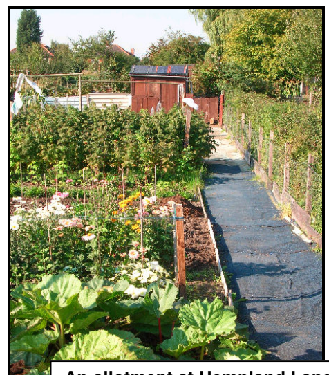
An allotment at Hempland Lane. Allotment usage is increasing each year and is now at record levels.